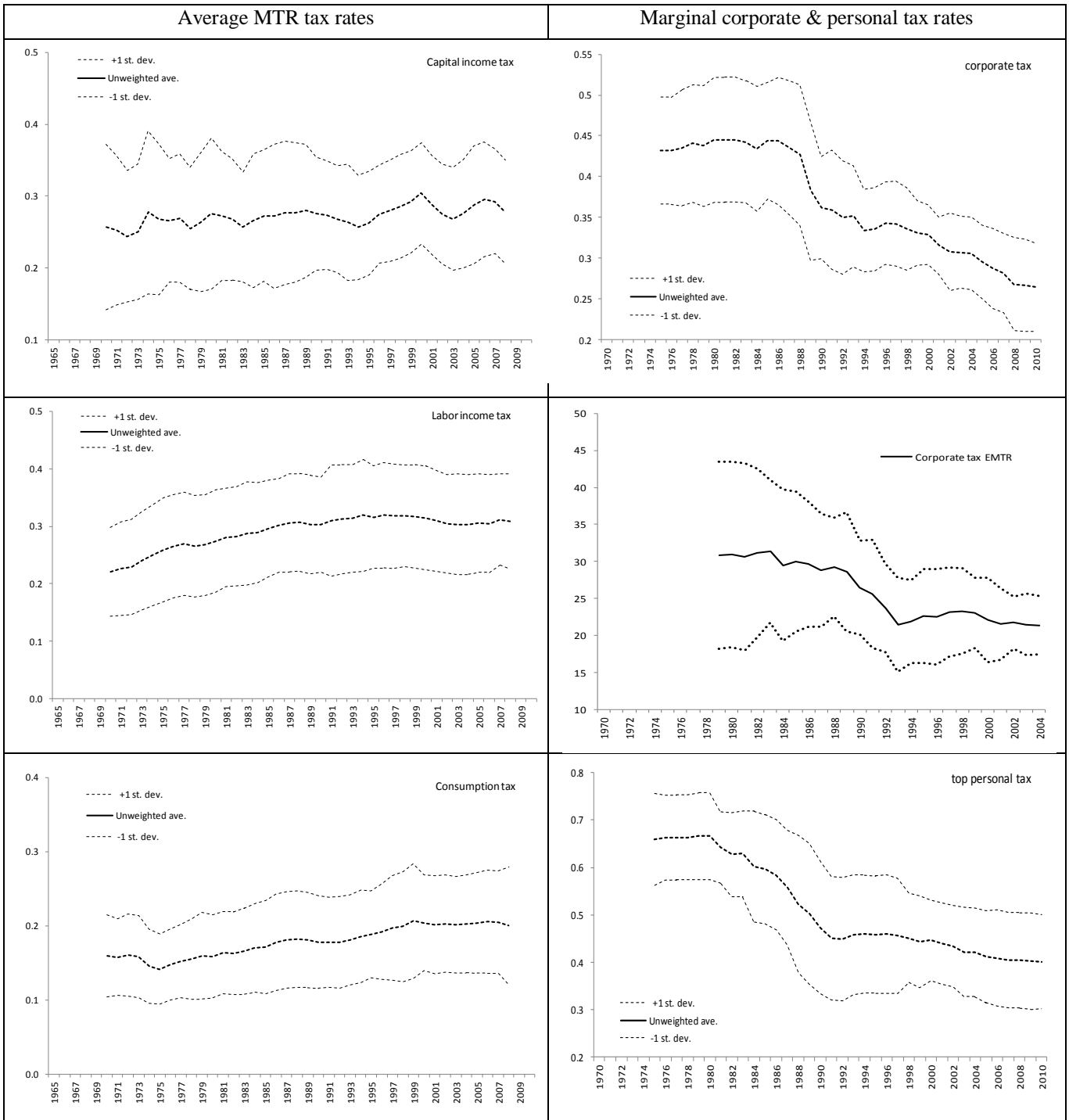
Figure 2 Tax Rates

Sources: MRT tax rates: McDaniel (2007); Corporate & top personal tax rates: TPRC, University of Michigan, IFS (2005) and OECD (2012).